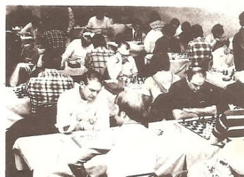
Round 1 ?/ Fairfield Glade