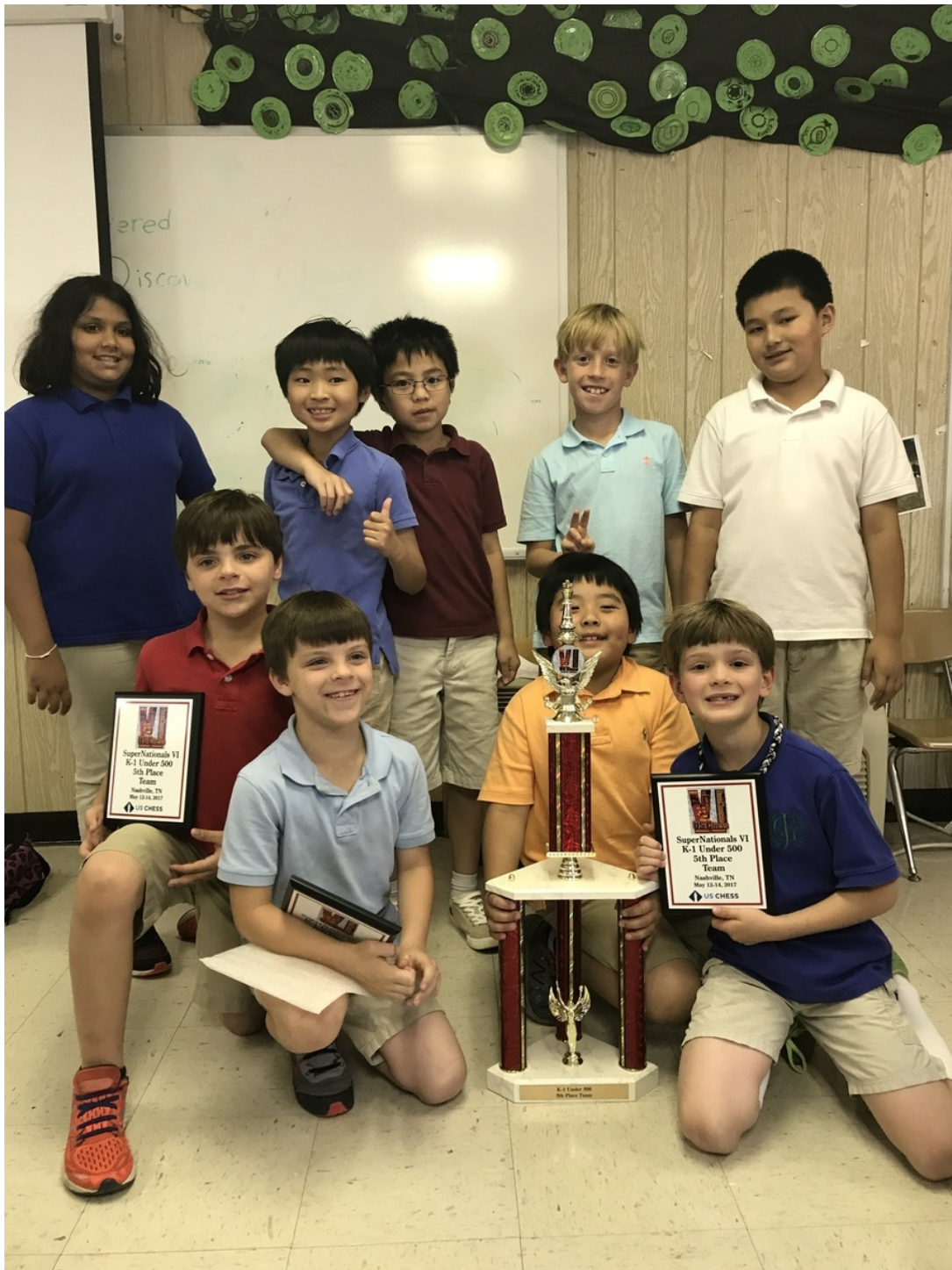
Julia Green Elementary Chess Teams celebrating their successes back at school.