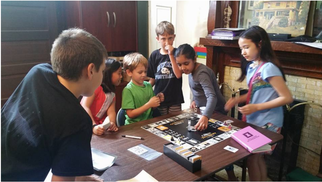
Trivopoly at the Nashville Chess Center Summer Camp