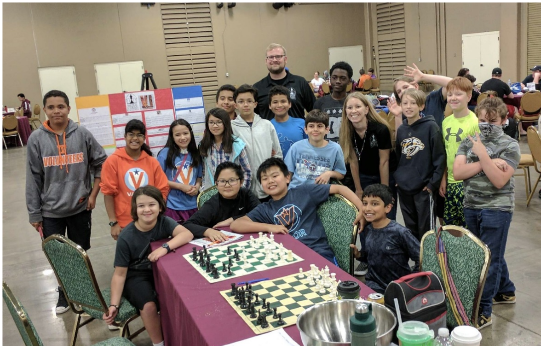
Nashville Chess Center and Valor Collegiate Academy training and camping in the skittles room.

Remarkable results from our Tennessee K-12 players! Congratulations winners and special thanks to all who helped make this event one we will never forget!