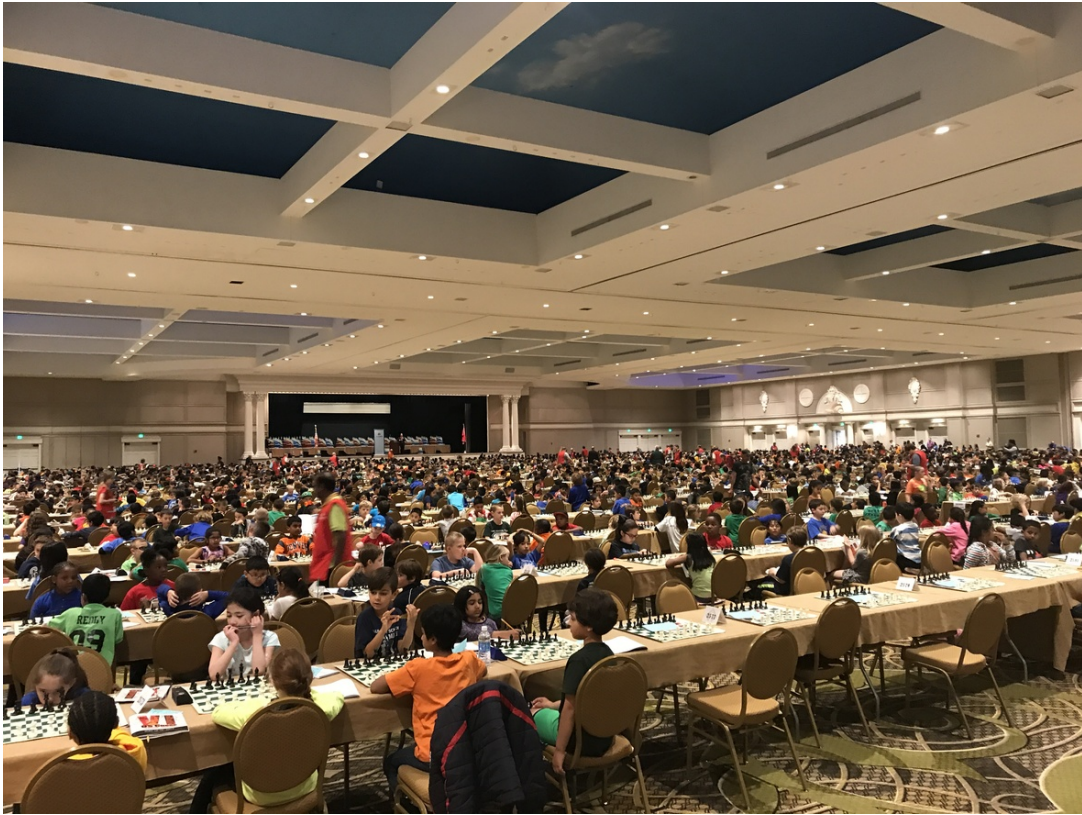
K-6 Playing Area at Super Nationals VI. There were four more ballrooms full of kids just like this!

The United States Chess Federation just hosted the largest rated chess tournament in the world of all time, and they did it right here in our great state of Tennessee! This record-breaking event took place over Mother's Day weekend in May drawing in 5,577 players to the Opryland Hotel in Nashville. Players competed across 25 sections based on their grade level and experience. The Tennessee Chess Association is very proud of all our chess kids and teams who helped contribute to this amazing event. Tennessee National Prize Winners include: