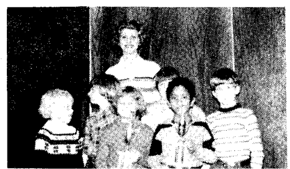
TOP PRIMARY TEAM