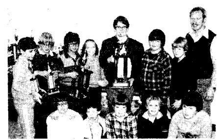
TOP ELEMENTARY TEAM

(Editors Note: Please, someone, from each city marked ???, let us hear of your club activities and meeting dates. Thanks)