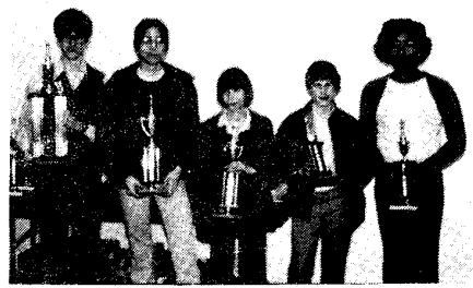
TOP JUNIOR HIGH INDIVIDUALS