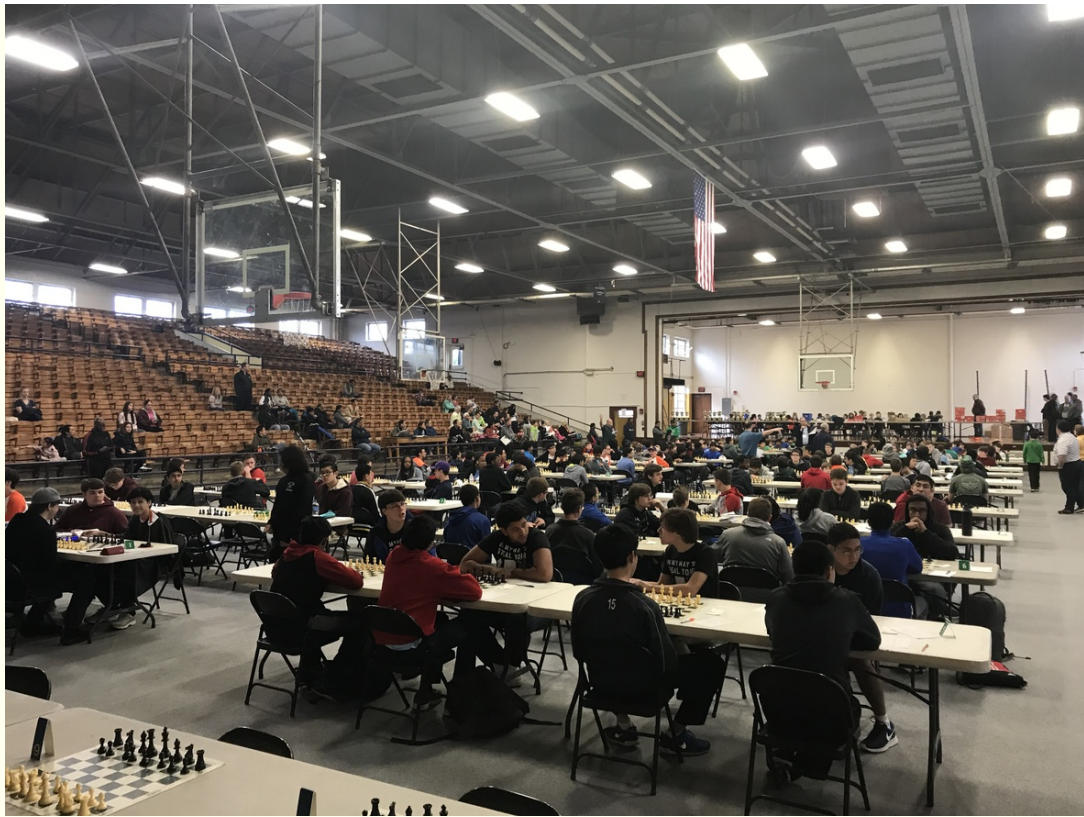
2018 Tennessee Team State Championship before round 1