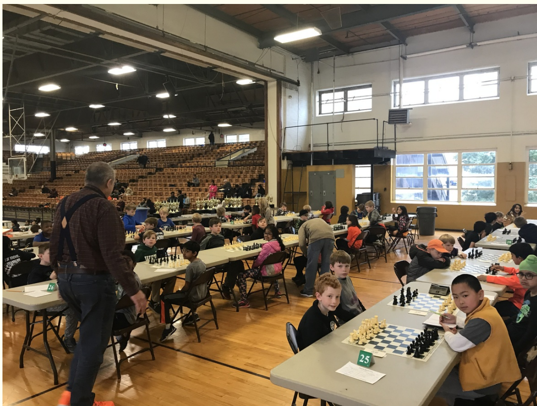
Primary players on the stage and ready for round one